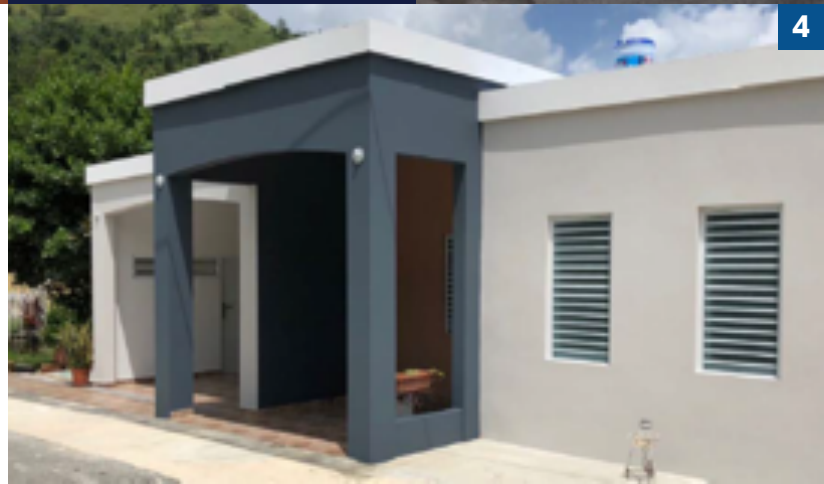
1. Before 2. After 3. Before 4. After